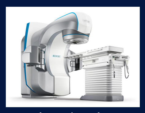
The Varian Edge